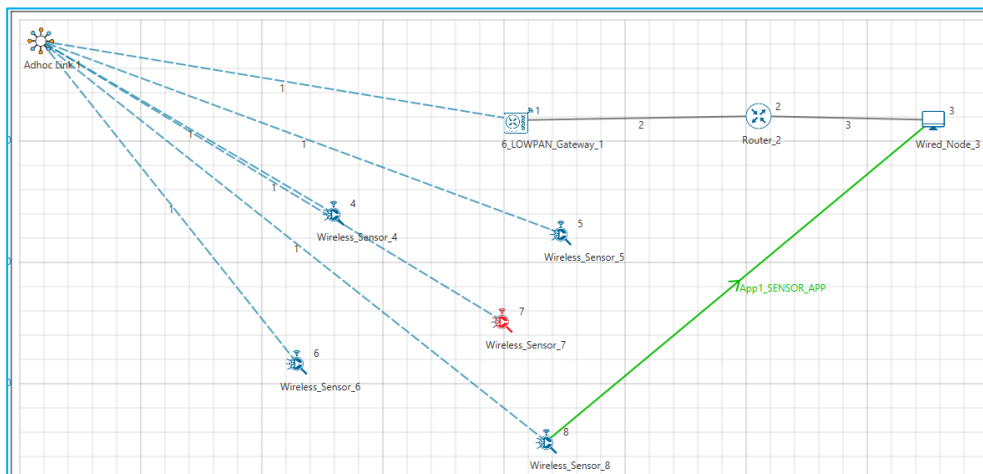
Figure 2: WSN Network Topology